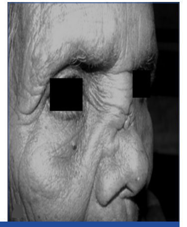
[Table/Fig-1]: Pre-operative photograph of Ethmoidal mucocele and Saddle nose deformity [Table/Fig-2]: Post-operative photograph at the end of three months [Table/Fig-3]: CT Paranasal sinuses - Coronal cut